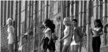
Child and enforced prostitution