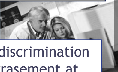
Sexual discrimination and harrasement at work