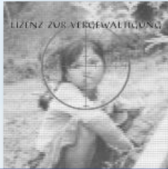
* Rape as a weapon of