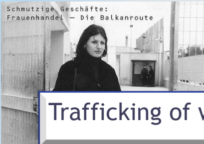
Trafficking of women