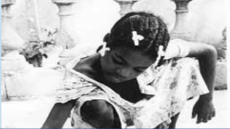
FGM: female genital mutilation